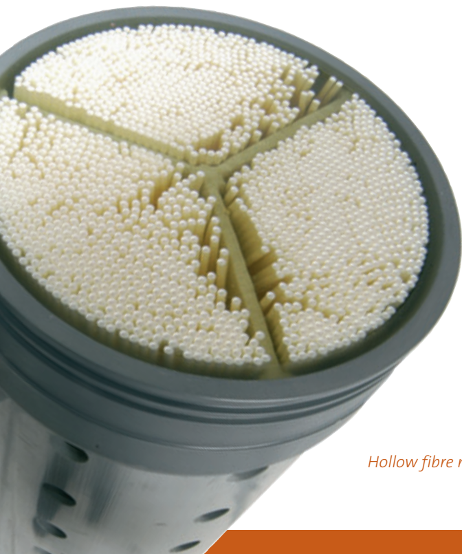
Hollow fibre module

The filtrate capacity is maintained at a constant level through continuous backwash of the hollow fibre modules.