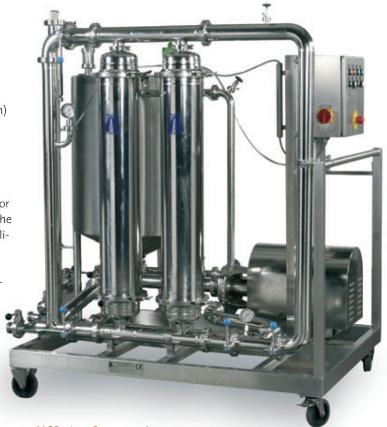
MCC 2/120 C17 manual

High-pressure version , also possible for the filtration of champagne or carbonated wines. Here filtration takes place at the pressure level of the champagne tanks.