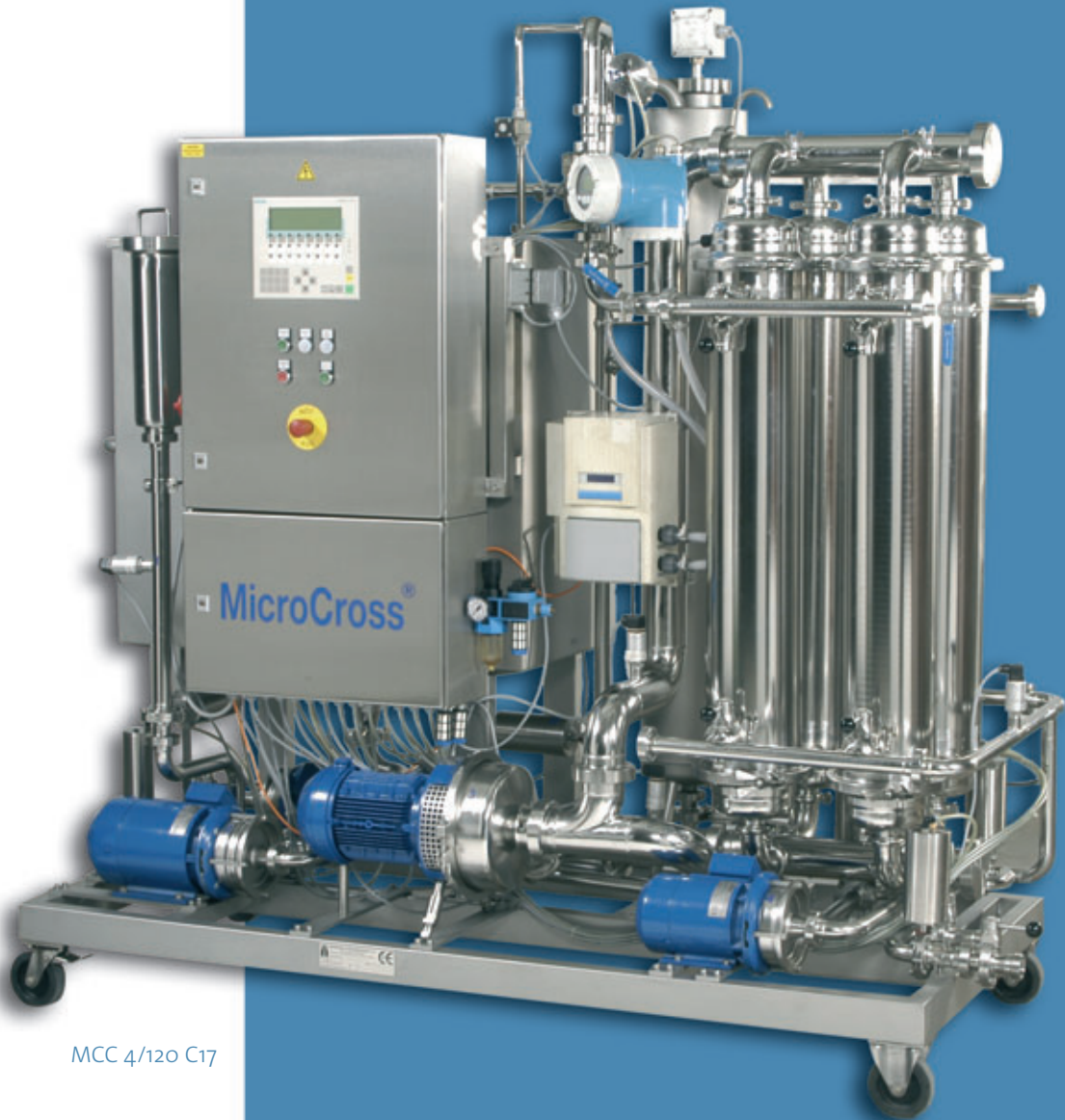
MCC 4/120 C17

FILTERS | SYSTEMS | APPARATUS ENGINEERING | SEPARATION TECHNOLOGY | SOLID-LIQUID